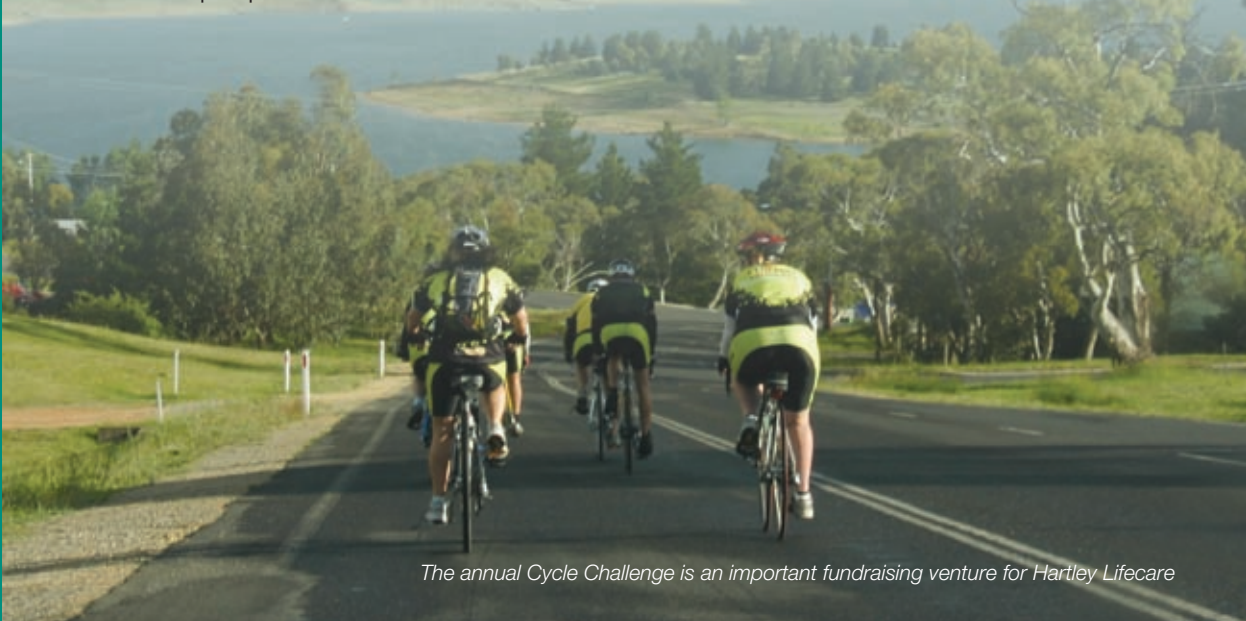
The annual Cycle Challenge is an important fundraising venture for Hartley Lifecare