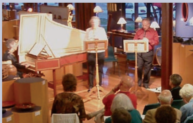
A soothing concert at Bungendore Woodworks Gallery