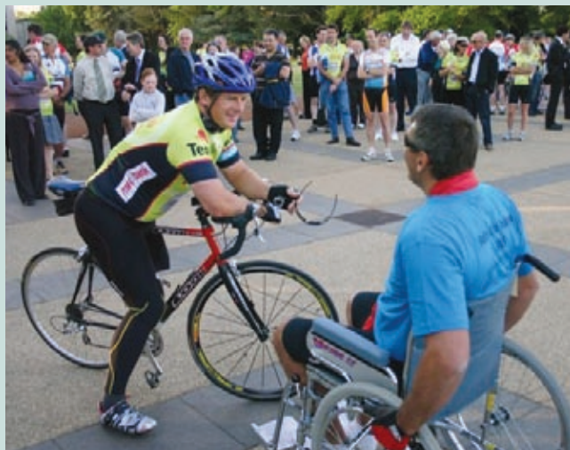
Michael Milton, Australia's best known Paralympic athlete and Australia's fastest skier, at the Cycle Challenge 2007 launch.